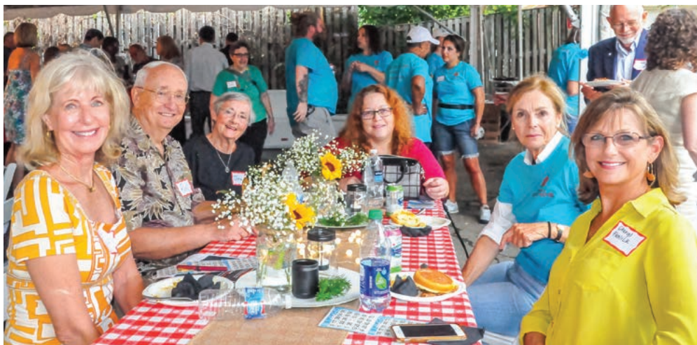
More than 160 people attended Friends of Guest House's 45th Anniversary Celebration on September 5, 2019. The event was held at Guest House's newest location in Old Town Alexandria.