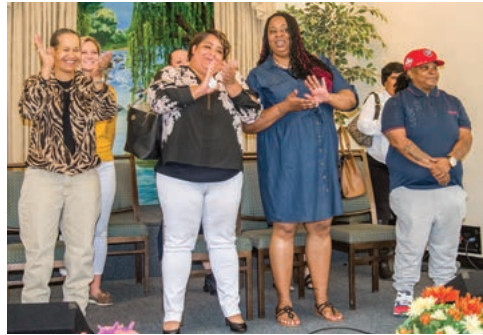
Ten women graduated from the Friends of Guest House program on September 28, 2019.