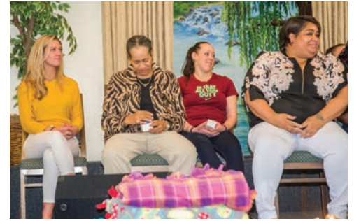
Each Friends of Guest House graduate receives a pair for pearl earrings courtesy of the Alexandria Kiwanis Club. It is a tradition that has continued for 15 years.