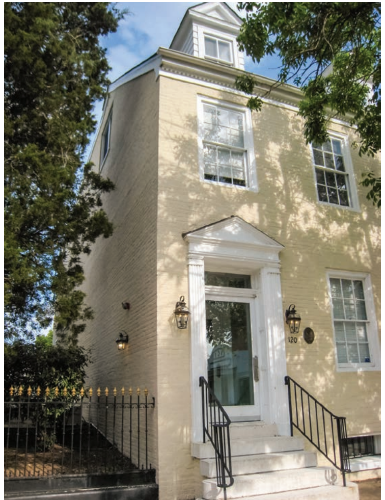
Friends of Guest House's newest location in Old Town Alexandria is home to 20 women in the Residential Program.

The opening of this new home increases the capacity of the Residential Program by 15%. Guest House receives nearly 400 applications for its Residential Program every year. Previously, we served 26 reentering women at-a-time for six months, 55-60 total per year. Now, thanks to you, we can serve 30 women at-a-time, for a total of 60-65 reentering women per year.